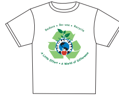
Adult Medium Adult Large

ADULT SIZES FOR TEACHERS, PARENTS AND GRANDPARENTS ARE AVAILABLE TOO!!