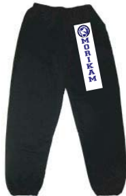
Adult Small Adult Medium